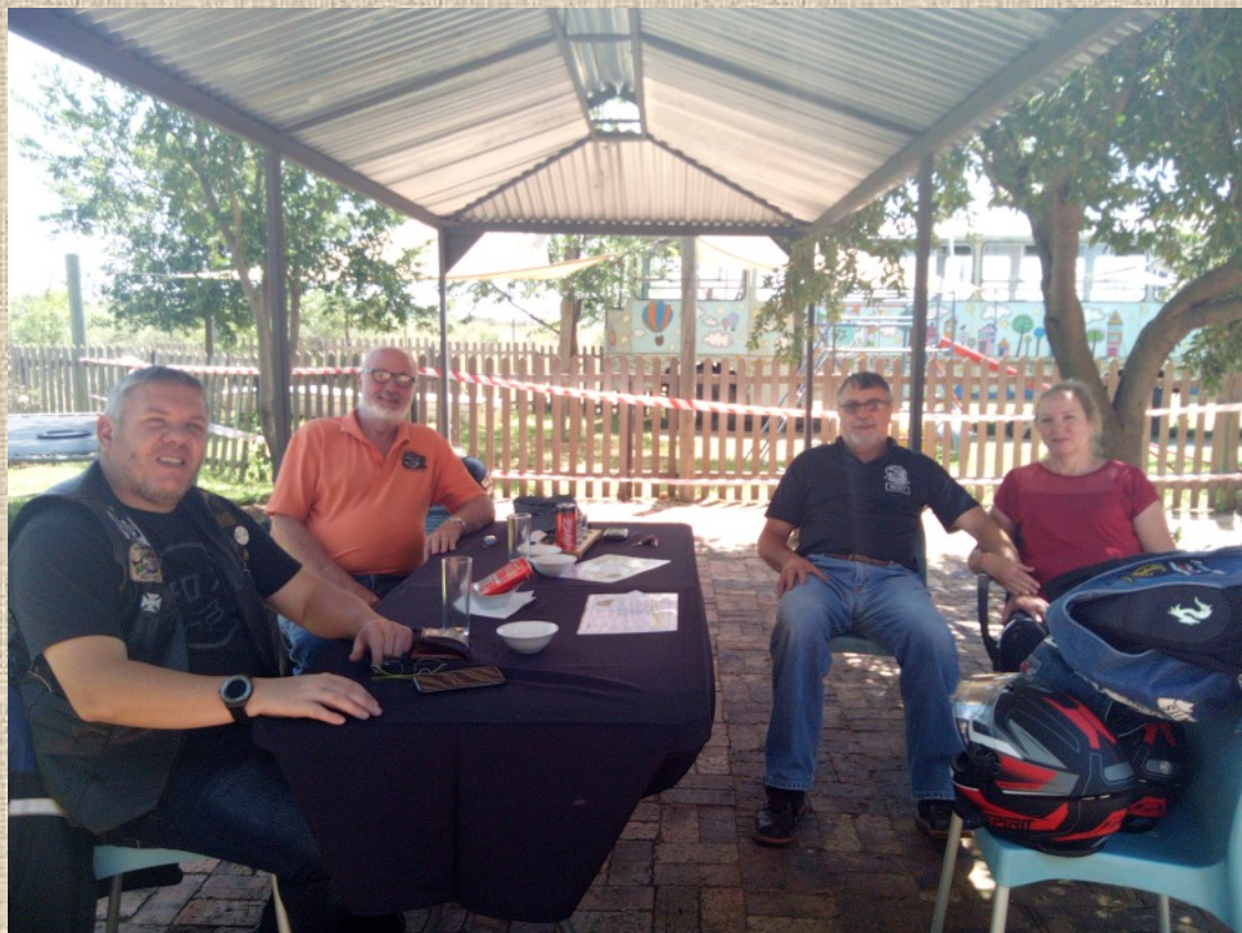
The group kept to the Social Distancing Rules